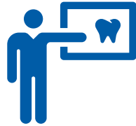
Oral Health Education