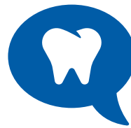
Connection to Community Resources